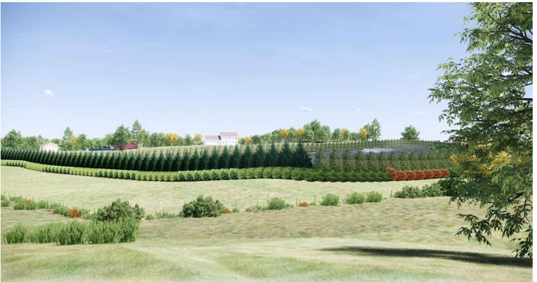
Photo 6. Proposed Buffer Plan, Year 5, Looking southeast from 300 Highland Avenue