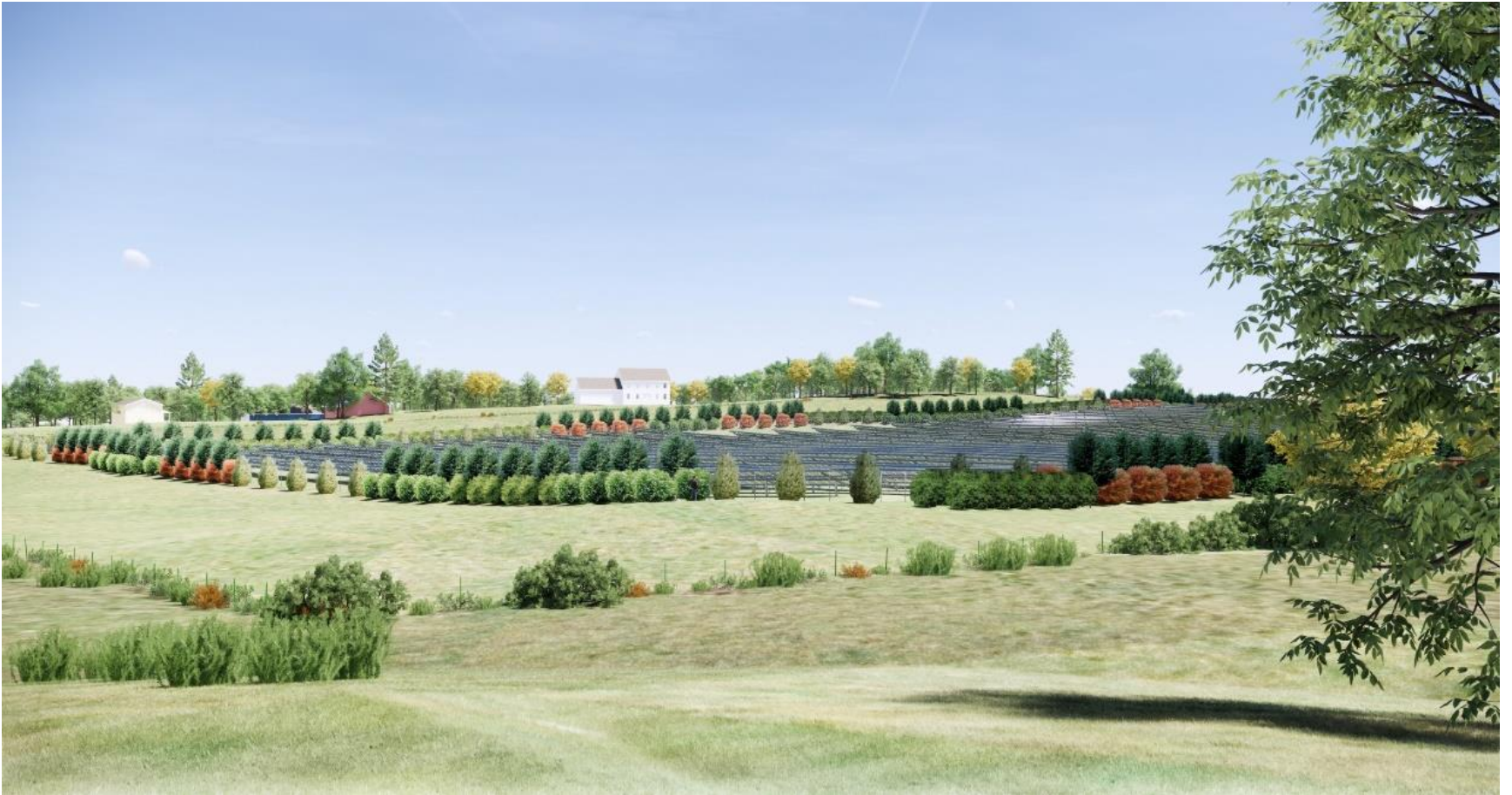
Photo 5. Approved Buffer Plan, Year 5, Looking southeast from 300 Highland Avenue