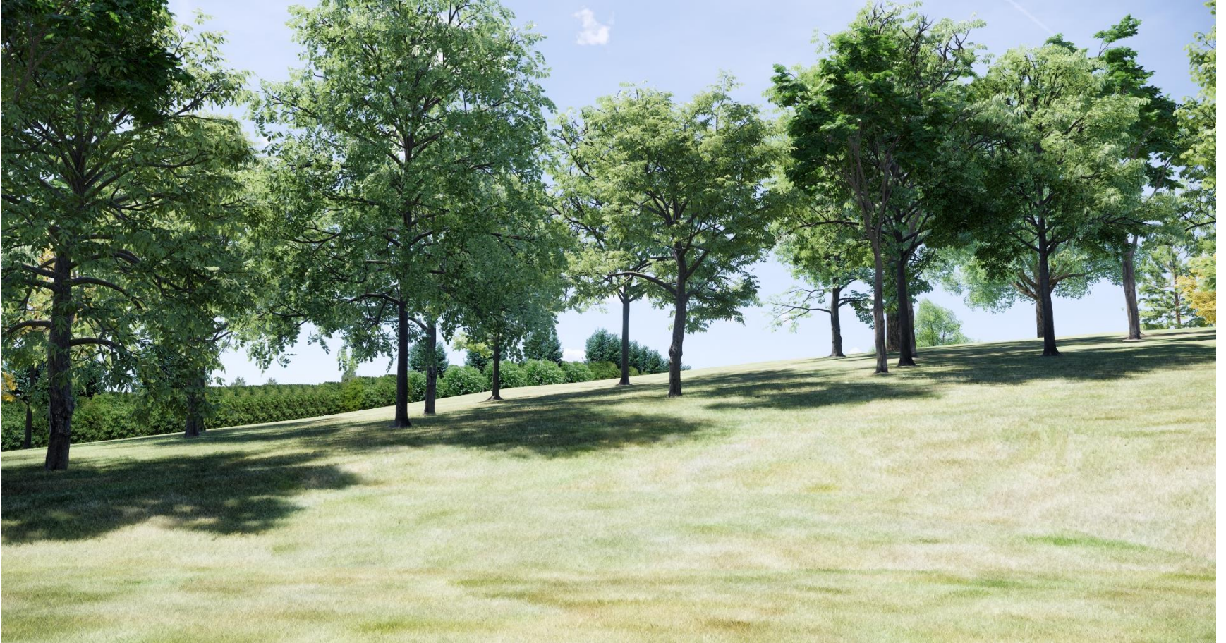
Photo 7. Approved Buffer Plan, Year 5, Looking west from 101 West Hill Road