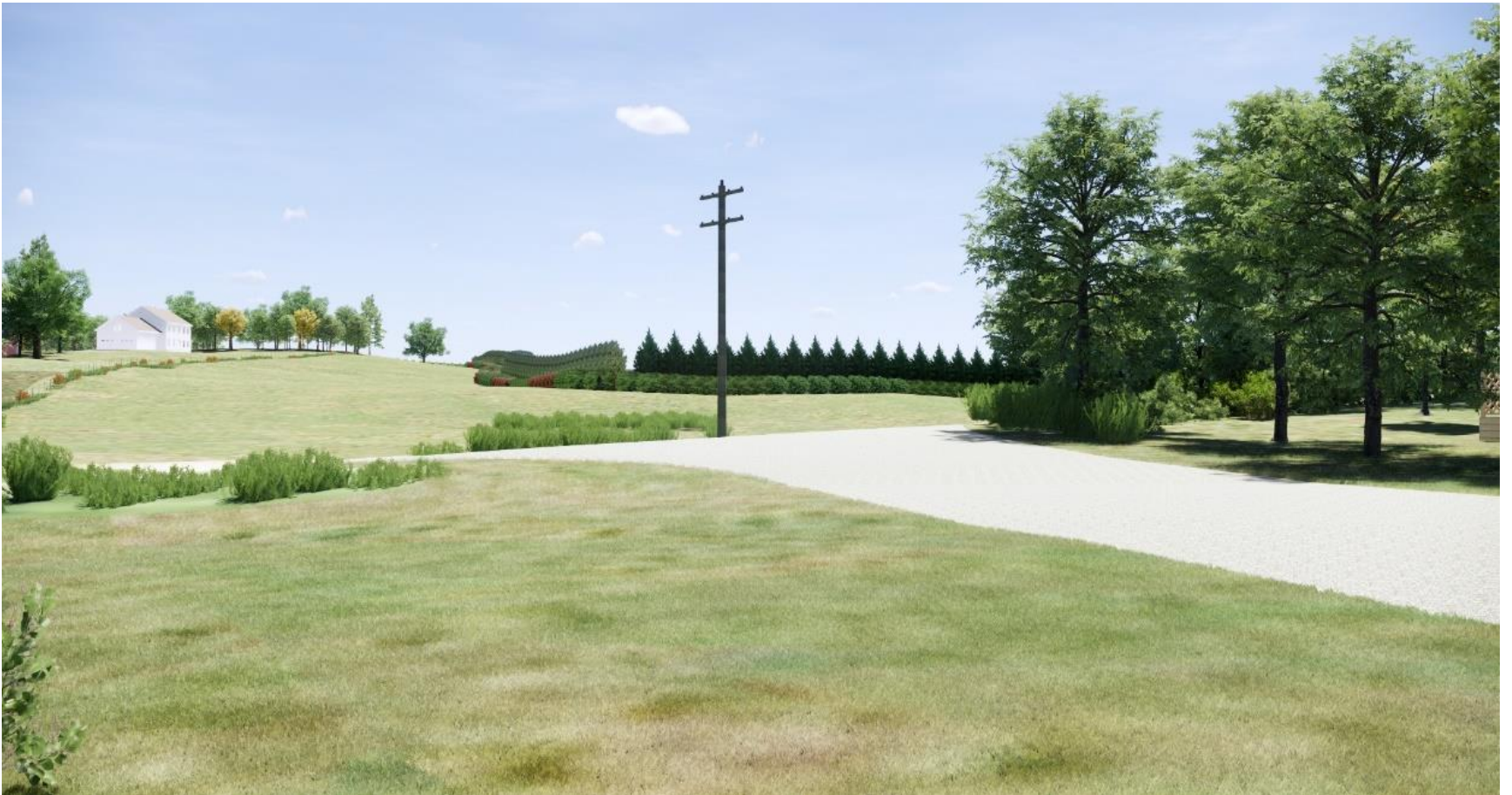
Photo 4. Proposed Buffer Plan, Year 5, Looking south from 3 Orchard Street