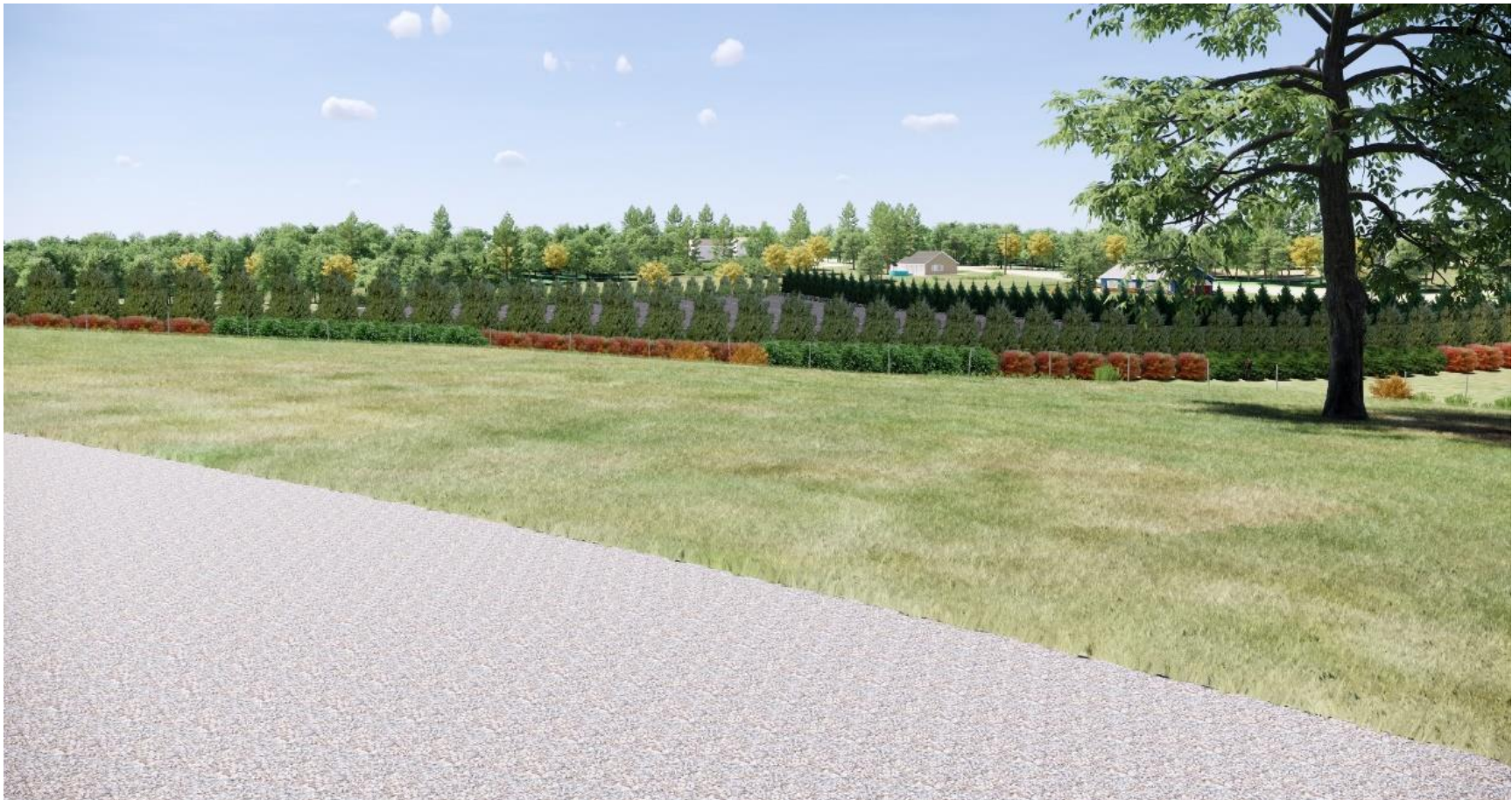
Photo 2. Proposed Buffer Plan, Year 5, Looking west-northwest from 16 Old Dairy Road