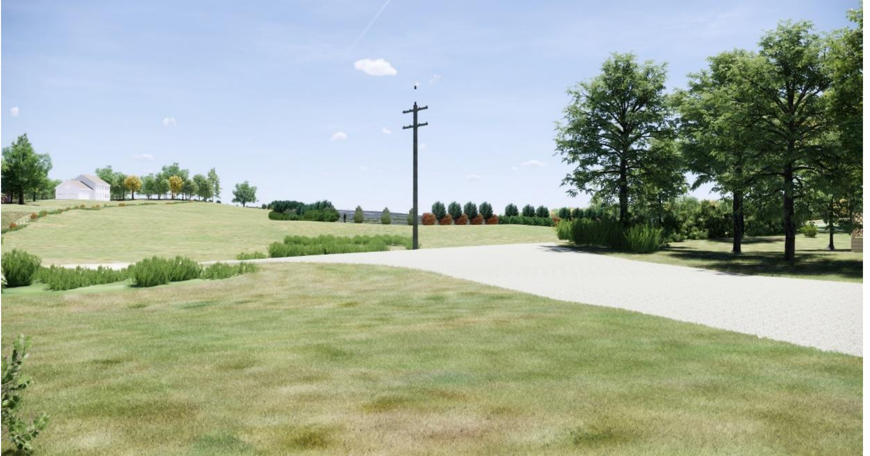
Photo 3. Approved Buffer Plan, Year 5, Looking south from 3 Orchard Street