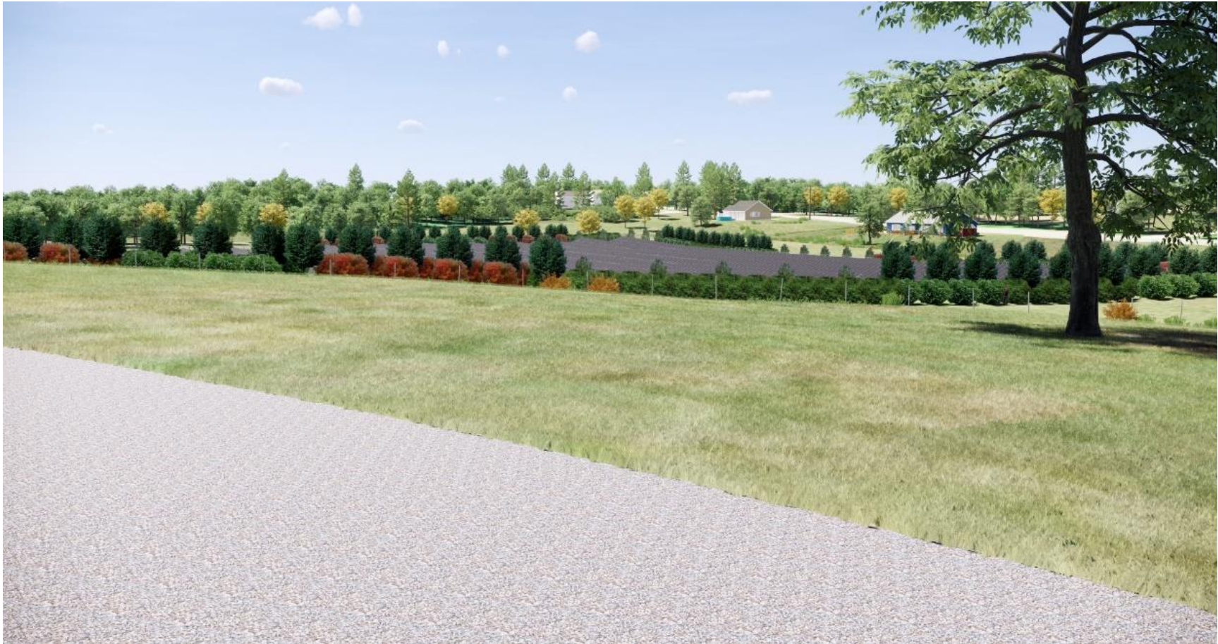
Photo 1. Approved Buffer Plan, Year 5, Looking west-northwest from 16 Old Dairy Road